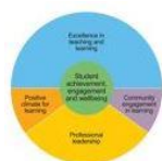
Framework for Improving Student Outcomes